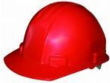
Certified industrial safety helmets

The following PPE must be worn by each contractor employee whilst accessing or working within all Forth Ports premises.