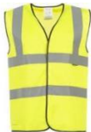
Certified Hi-visibility clothing

Footwear with metallic components that may cause sparks is not permitted